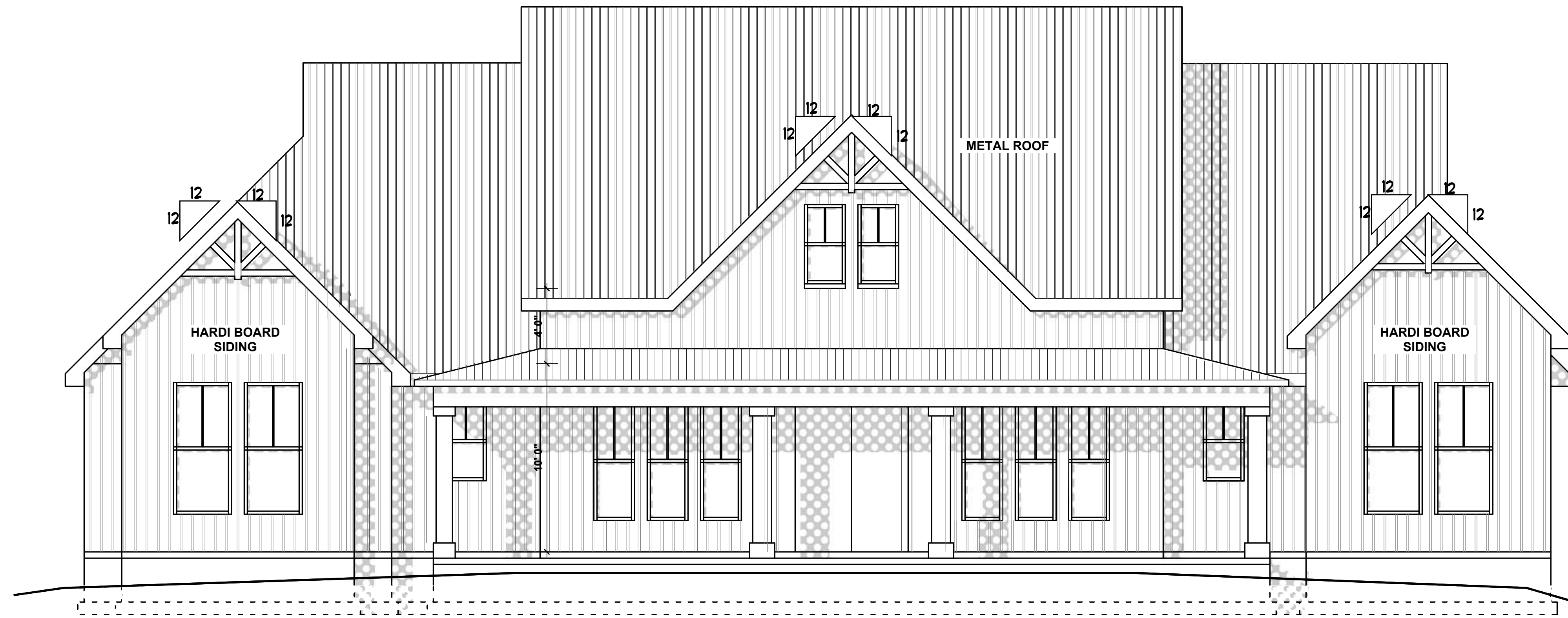
2 FRONT ELEVATION SCALE :: 1/4" = 1' - 0"