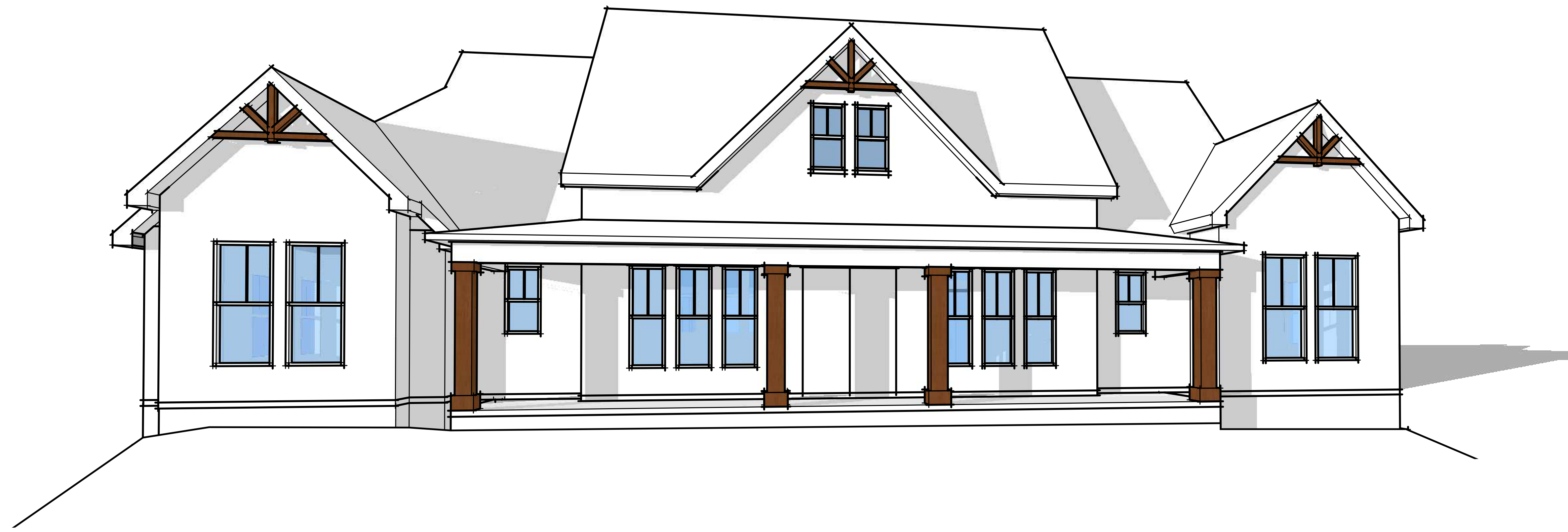
1 3D PERSPECTIVE